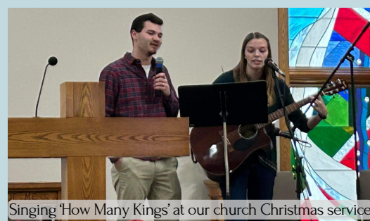
Singing 'How Many Kings' at our church Christmas service