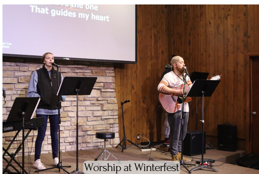
Worship at Winterfest