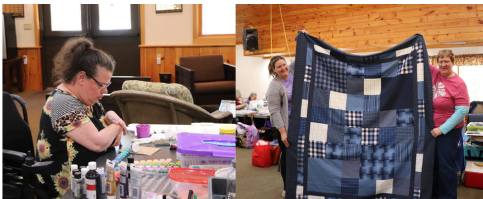
Some very talented ladies making fun memories at Crafter's Retreat.

During the spring season, we had several retreats at camp including a board game retreat and two crafter's retreats. Serving at camp during these retreats was a new experience for me (since I have primarily just been here during the summer season in the past), but it was so good! I loved interacting with our guests and having good conversations with them. I also really enjoyed seeing the impact that camp can have on the lives of adults. If I had to summarize these retreats in a sentence, I would say meals were shared, hobbies were enjoyed, stories were exchanged, and the Gospel was proclaimed. Success!